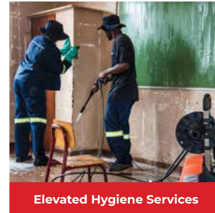
Elevated Hygiene Services