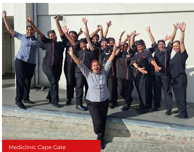
Mediclinic Cape Gate

Mediclinic Cape Gate: This expansion is a testament to our ability to adapt and grow while maintaining high standards of service.