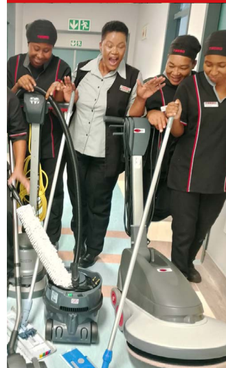
Denmar Specialist Psychiatric Hospital