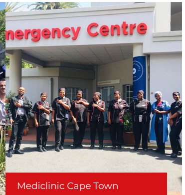
Mediclinic Cape Town